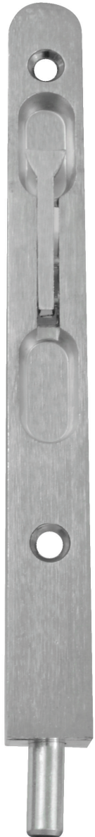
Shown in Matte Chrome