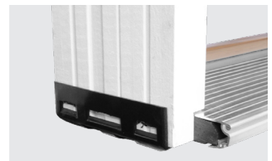
Installed Jamb Skid - Front Side View

Thank you for your ongoing partnership. If you have any questions or concerns regarding any item covered in this release, or would like to discuss the jamb skid in greater detail, please do not hesitate to contact your Endura Sales Representative or Territory Sales Manager.