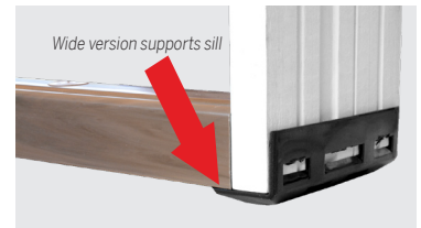
Wide version supports sill Installed Jamb Skid - Rear Side View